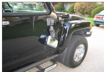
Actual eEstimate photo

EEstimates: Another example of why Collex Collision remains the industry leader and the best choice for collision repair.